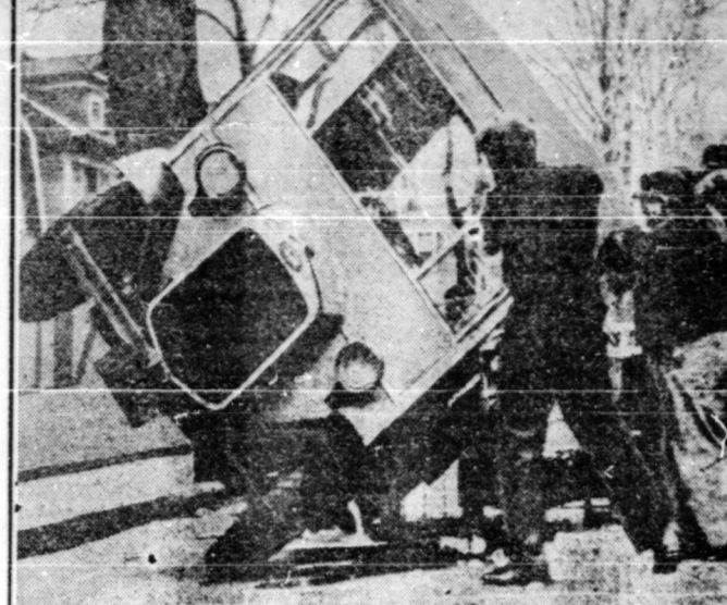
A "pick-up" crew is righting an overturned truck during a full in milk drivers strike in Toledo, O. Deliveries to all but infants and the infirm were prevented in determined fight for action recognition.