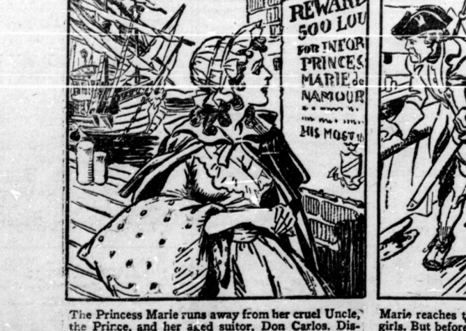
The Princess Marie runs away from her cruel uncle, the Prince, and her cruel aunt, Don Carlos. Disguised as her own maid, Marietta, she is going to sail to Louisiana with a young man who is to marry the French king. But on her way to the boat she is frightened on seeing a poster announcing a large reward for any information concerning her whereabouts.