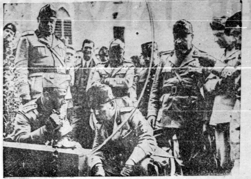
Premier Mussolini listens intently as radio operator explains workings of field set during maneuvers in Brenner Pass. He later tapped out a message to his forces in the field.