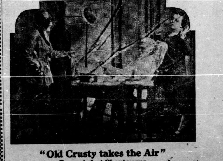
"Old Crusty takes the Air" Presented at Chautauqua