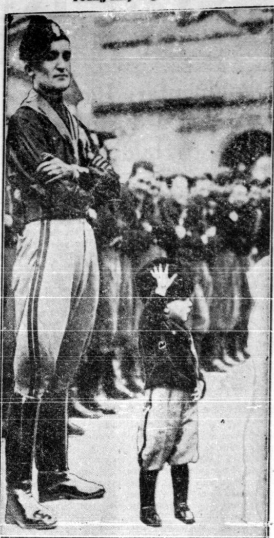
A three-year-old youngster, dressed in full Fascist regalia, salutes Italy's premier after addressed a gathering of over 100,000 young members on the 25th birthday of Rome.

Machines As Man-Haters "Men may be satisfied with their own superiority but machines are not. They prefer gifts." Thus spoke Sir Herbert Austin to a London audience recently in the course of an address wherein it was lightly suggested that the ultimate division of labour might present the spectacle of more and more men making machines while more and more machines were engaged to work them. In some ways it suggests an arrangement as convenient as the one mentioned in the nursery rhyme—Jack Spratt can make the machines while Mrs. Jack Spratt works and watches them, and between them the industrial plant will be kept clean and polished. But there is a more unfortunate side to reflections of this kind as applied to the modern world—what sort of labour will be left for man when he has made all the machines which are required for women to work.—Manchester Guardian.