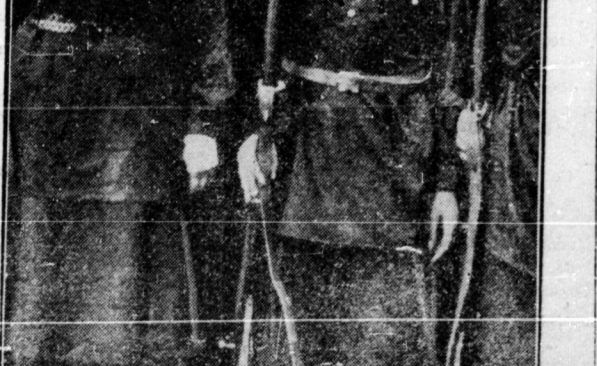
These young Amazons take their place in the ranks with the men. They are undergoing mixed military training near Moscow, where their officers are often young women, also.