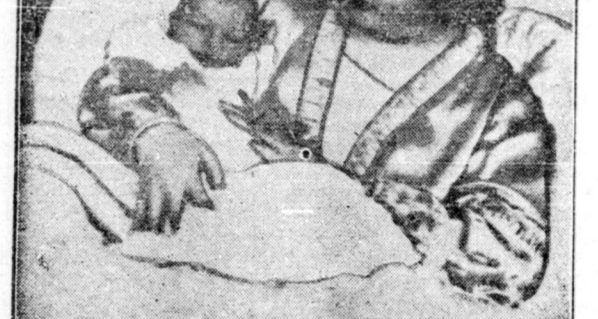
Here is the French wife of the wealthy Indian prince, Aga Khan, and new-born son as they appeared in the American hospital at Paris a short time ago.

FREE COOK BOOK—When you bake at home, the new Magic Cook Book will give you dozens of recipes for delicious baked foods. Write to Standard Brands Ltd., Fraser Ave. and Liberty St., Toronto, Ont.