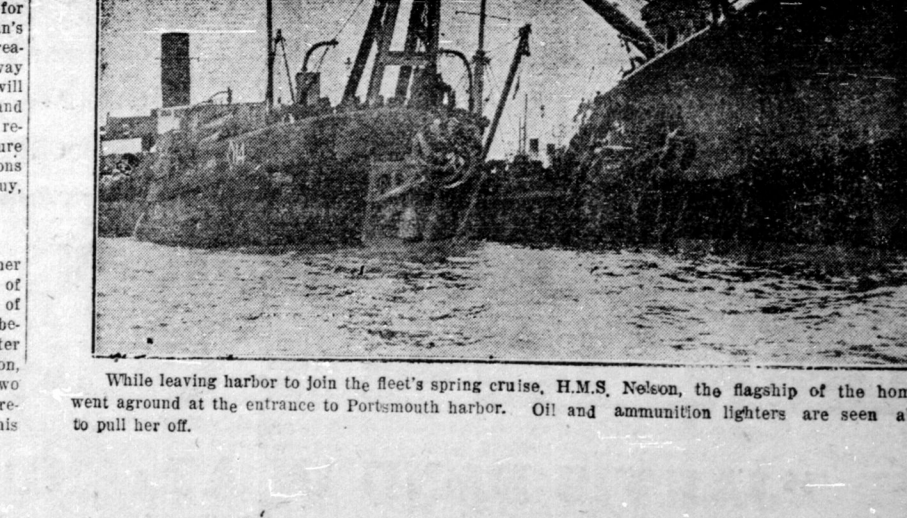
While leaving harbor to join the fleet's spring cruises, H.M.S. Nelson, the flagship of the home fleet, went aground at the entrance to Portsmouth harbor. Oil and ammunition lighters are seen alongside to pull her off.

H. M. S. Nelson Aground While leaving harbor to join the fleet's spring cruises, H.M.S. Nelson, the flagship of the home fleet, went aground at the entrance to Portsmouth harbor. Oil and ammunition lighters are seen alongside to pull her off.