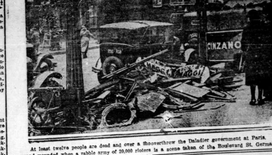
At least twelve people are dead and over a thousand wounded when a rubble strewed Boulevard St. Germain.

Toronto Landlords' Protective Association Toronto landlords have formed a protective association. The average English policeman is not in the least impartial. He smiles good-humoredly at the beggar who asks for a handout, but he is ready to fall six feet without serious cause. That is what man does. He will take care of a lost dog or a stray cat, but he will not take care of a human being. He will take care of a lost dog or a stray cat, but he will not take care of a human being. He will take care of a lost dog or a stray cat, but he will not take care of a human being.