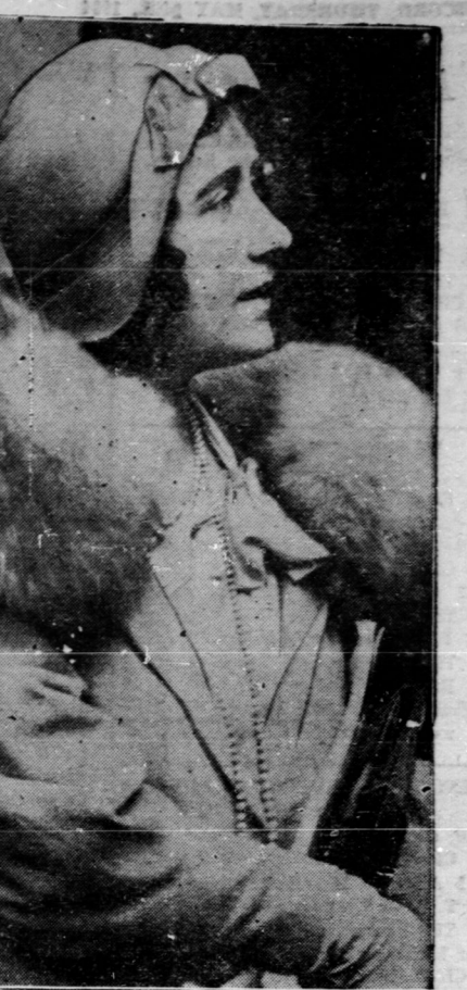
Her Royal Highness the Duchess of York was snapped recently by the cameraman when she was leaving an exhibition of 'Children Through the Ages' held at Chesterfield House, London.

On his right hand, Christ has represented himself as a shepherd; and now he represents himself as a king. This is the first part of an article on Christmas.