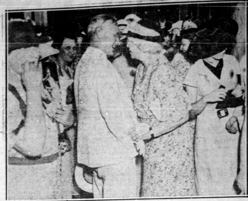
Going back to his home town, independence, Kan., for first time since his nomination, Governor Alfred M. Landon is enthusiastically greeted by his women neighbors at luncheon in his honor.