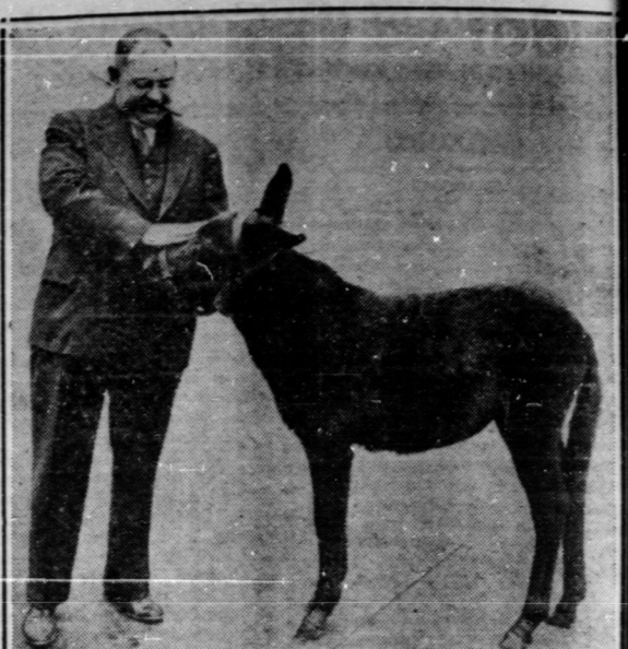
Lieutenant Governor J. B. Snyder with the donkey mascot. Snyder has been accepted as official Democratic Party mascot.