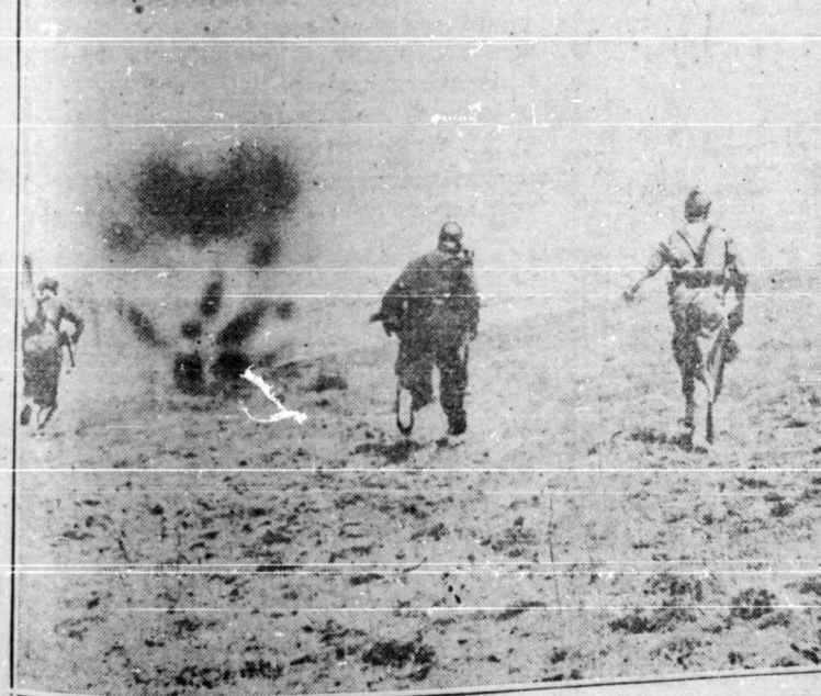
Loyalist troops surge forward against rebels as latter attacked train, northern Madrid outpost, center of bloodiest combat in Spanish civil war. Shellfire from rebels took huge toll among loyalists. Fall of city is imminent.