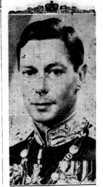
KING GEORGE VI Beloved Monarch of the British Empire who on Tuesday, December 14th, observed his forty-second birthday.