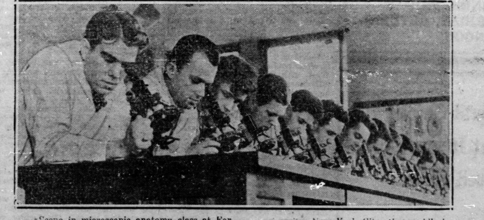
Some in microscopic anatomy class at Forham University, New York City, the world's largest Catholic university which holds enviable record of only ten years among its students of biology.