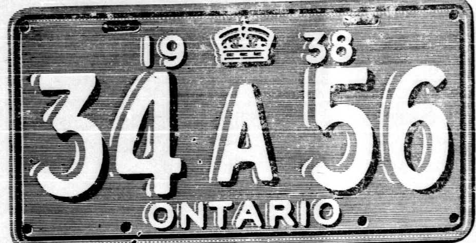
The design of the 1938 registration plates is exceptionally attractive with Crown and Orange figures on Blue background.

pepper, salt and paprika and this with milk to the right consistency. This makes a delicious soup, nourishing and tasty.