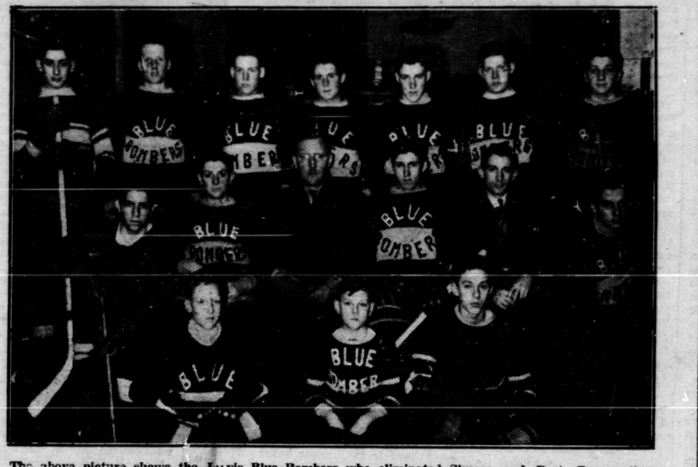
The above picture shows the Jarvis Blue Bombers who eliminated Simcoe and Port Dover from the Ontario Juvenile Hockey playoffs...