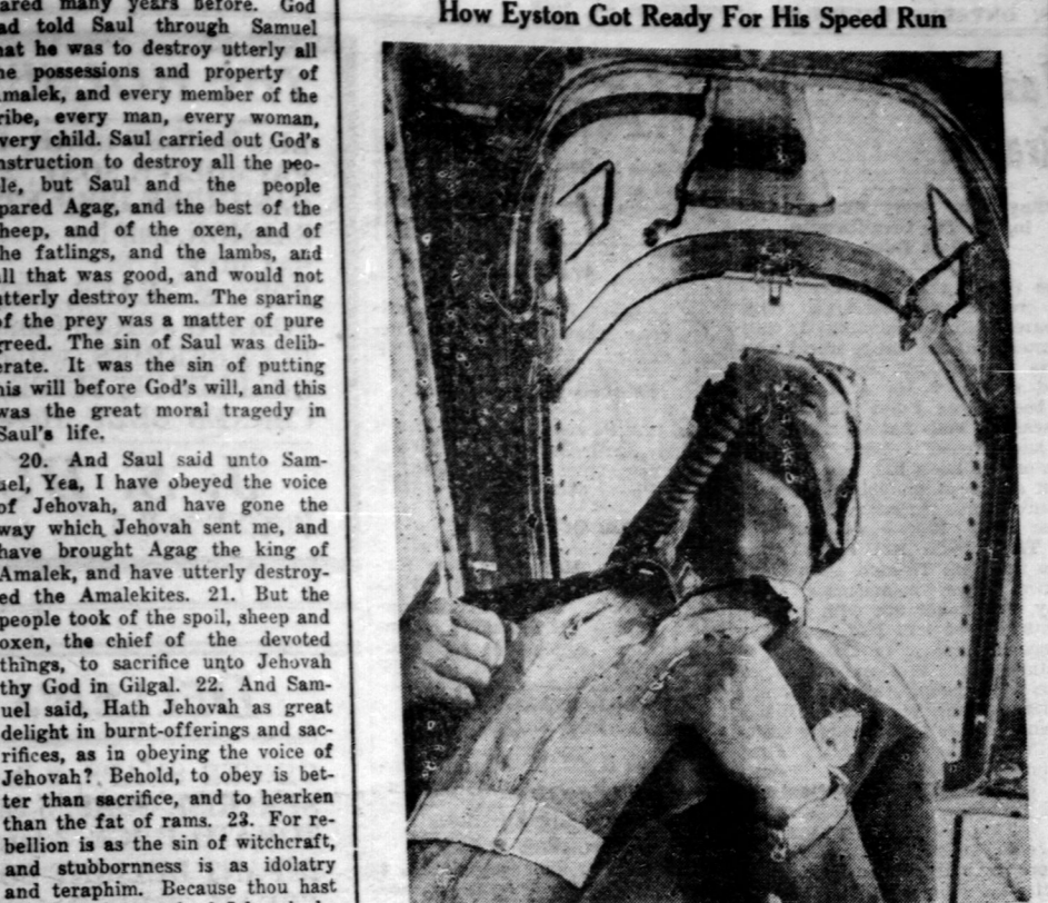
How Eyston Got Ready For His Speed Run Captain George E. T. Eyston dons his gas mask before taking his huge car for a speed run on the Bonneville, Utah, salt flats. He averaged the tremendous speed of 345 miles an hour in his "Thunderbolt."