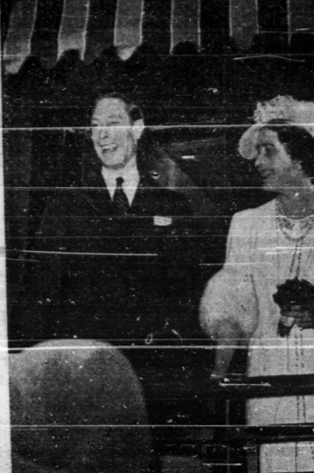
En route from Ottawa to Toronto, with a short stop at Kingston, the King and Queen are seen as they stepped out on to the balcony of their observation car as the royal train slowed, while passing through Brockville, where the residents were massed for their short greeting.

outward pressure very often lightened the inward bands, and where mutual confidence diffused continual joy.