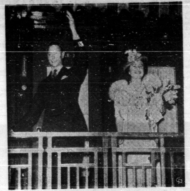
Leaving Sussex, N.B., Their Majesties are pictured here on the rear platform of the royal train as they waved farewell.