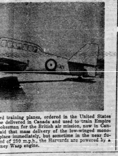
Several hundred Harvard training planes, ordered in the United States by Great Britain, will be delivered in Canada and used to train Empire pilots, according to a spokesman for the British air mission, now in Canada.