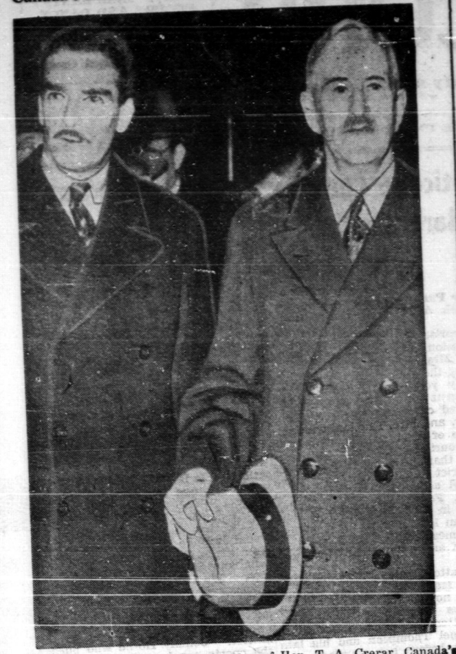
Anthony Eden, was the official greeter of Hon. T. A. Crerar, Canada's minister of mines, when the latter arrived in London to participate in the Imperial War Talks now taking place.