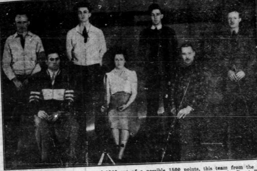
Posting the outstanding score of 1500 out of a possible 1500 points, this team from the Leacock Rifle Club, Brentford, Ont., in the first round of the Dominion Marksmen Rifle Competition...