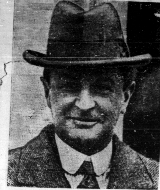
Stricken suddenly, the Marquess of Lothian, British ambassador to the U.S., died in Washington a few hours after a speech he had written was read to a Baltimore audience. In his speech, Lord Lothian challenged the people of the U.S. to help Britain. With such help, Britain "can win and win decisively in 1942, if not before," he declared.