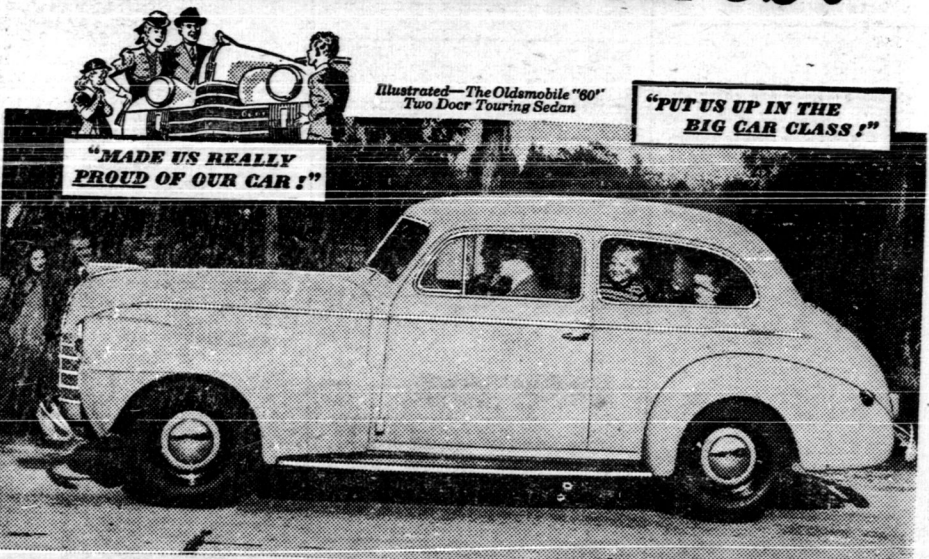
Illustrated—The Oldsmobile '40' Two Door Touring Sedan

"LOOK WHAT A FEW EXTRA DOLLARS DID FOR US!"