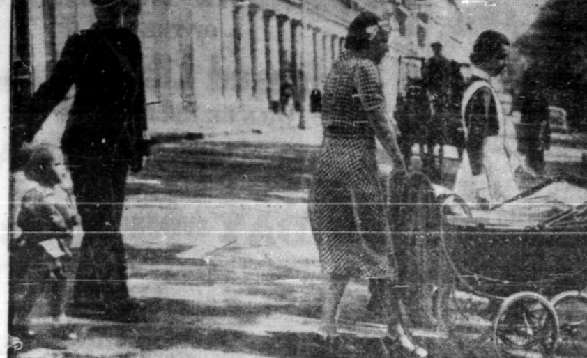
When the royal family of Holland settled in London, the daily routine of the two children of Crown Princess Juliana, heiress to the throne, was resumed. Here is a picture sent to New York by radio from Holland's Princess Irene, strolling behind, in custody of a London Boy, is Princess Beatrix, 2.