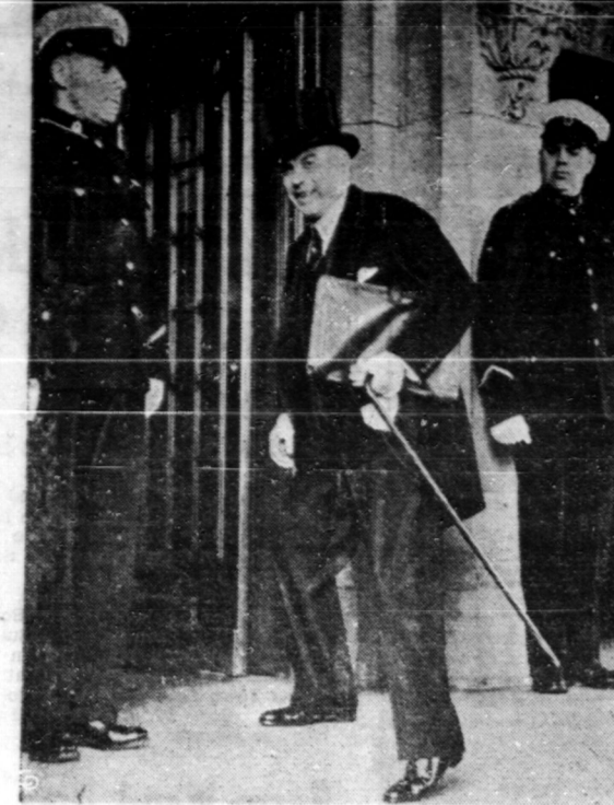
Prime Minister King arrives at the parliament buildings in Ottawa for the opening session of Canada's 19th parliament. The Speech from the Throne was read by Sir Lyman Duff , acting governor-general.