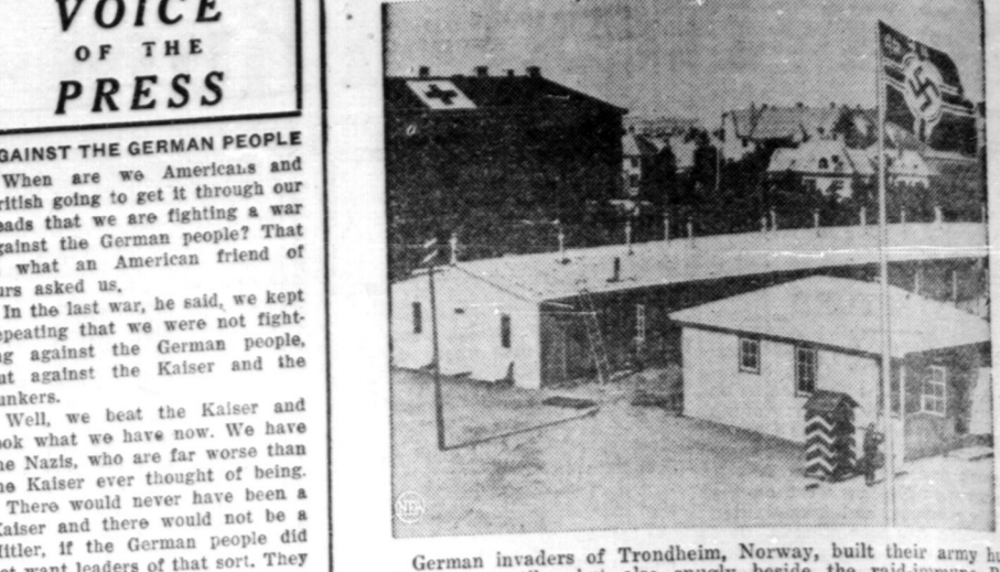
German invaders of Trondheim, Norway, built their army camp under the swastika, but also sang beside the red-cross Red Cross hospital for protection from R.A.F. bombers, according to British censor's caption on this picture.

Save 2/3ds PHILCO 2157 Only $39.95 PHILCO 2157 4 Tubes, One Cabinet, Complete with AB Battery Unit