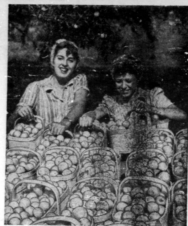
These smiling farmettes personify the spirit of the hundreds of girls who are serving on farms this summer to help relieve the situation caused by an acute shortage of manpower all over the country.