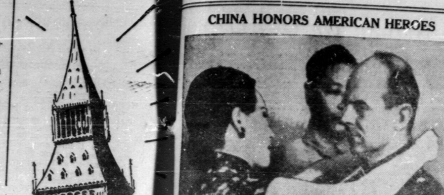
Mrs. Chiang Kai-Shek, presents the Military Order of China to Gen. (Now Major Gen.) James Doolittle, who led the bomber raid on Tokyo, for the part he played in the surprise American attack on the Japanese main island.