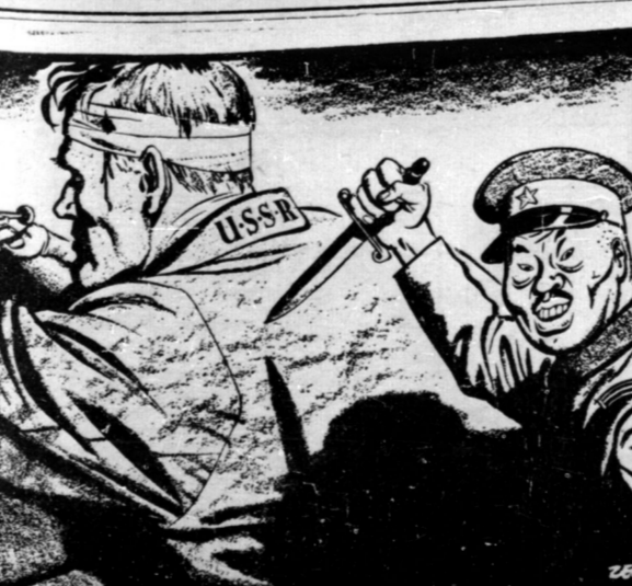
NOW, HERR HITLER? Caption from the London Daily Mirror