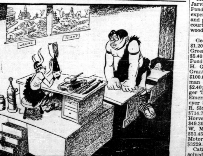
THE SCHOOLBOY WHICH OVERGREW HIS MASTER