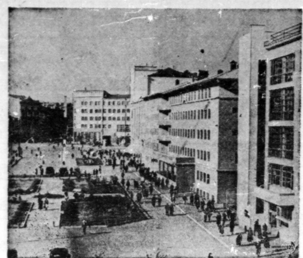
Street scene in great Soviet city of Stalingrad, now menaced by axis armies.