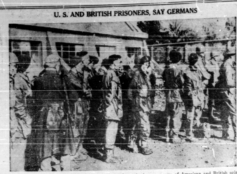
U. S. AND BRITISH PRISONERS, SAY GERMANS