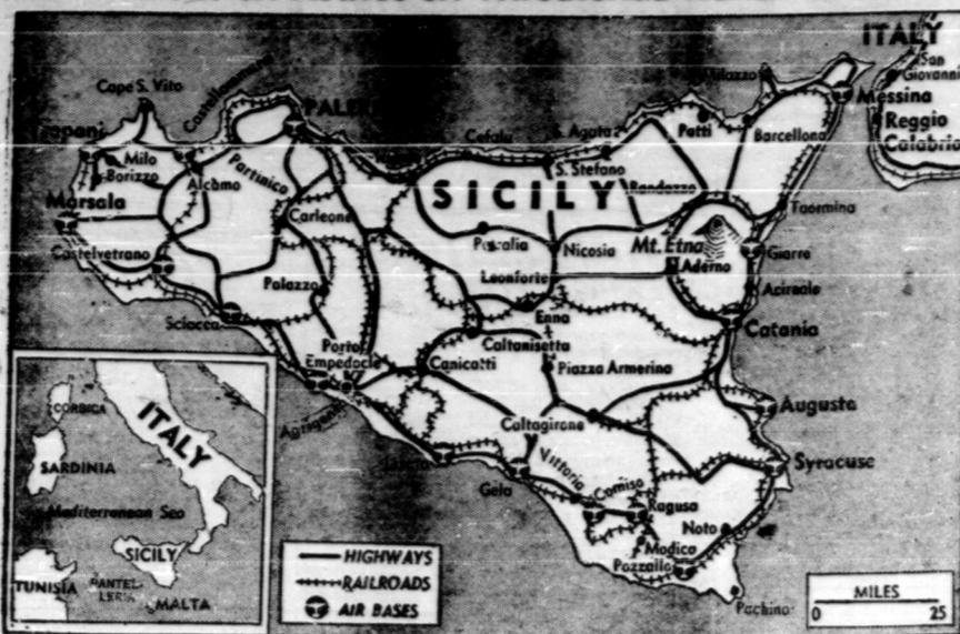
Sicily's highways and railroads are potential avenues of invasion for Allied armies. Map shows how the island is criss-crossed by transportation routes made to order for mechanized warfare.