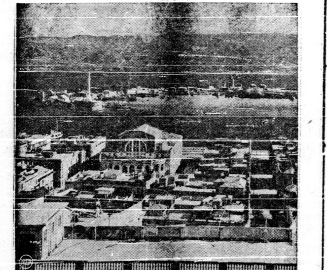
When Allies reach Messina, at the northeast tip of Sicily, they will be in sight of the Italian mainland. Here are some of the modern buildings in Messina, the hook-shaped harbor and, in the background, the coast and hills of Italy.