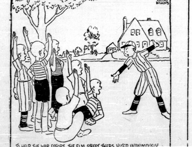
TO HELP THE WAR EFFORT, THE FIRM SURELY NEEDS YOUR DONATIONS. NOT TO RISK BREAKING WINDOWS BY HITTING HOME RUNS ACROSS THE ROAD. (SICILY'S "SOLE" SHIRT IN ALL ITS HONORARY NO MEMBERS OF THE LEAGUE HAS BEEN ABLE TO HIT A BALL FOUR FAR AWAY.)