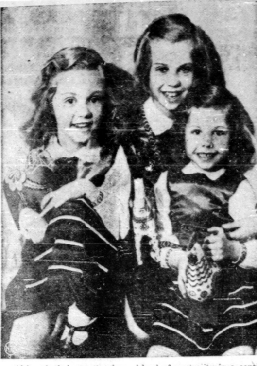
Although their country is an island of neutrality in a continent of war, these three little Swedish princesses have gay smiles for the camera at their home near Stockholm. They are Princesses Birgitta, Margaretha, and Deception, daughters of Prince Gustaf Adolf and great-granddaughters of King Gustaf V.