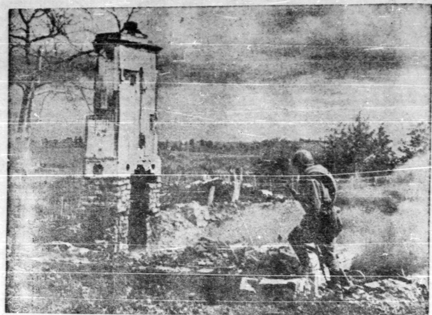
Gray bleak ruins remain to greet him as a soldier of the Red Army returns to his home in town taken from the Nazis. This dramatic picture is from the March of Time's "One Day of War," documentary film of a single day on the many fronts of Russia as filmed by 120 Soviet soldier-photographers.