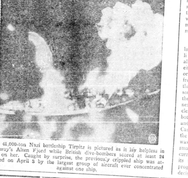
The 41,000-ton Nazi battleship Tirpitz is pictured as it lay helpless in its berth. Caught by surprise, the previously crippled ship was attacked on April 3 by the largest group of aircraft ever concentrated against one ship.