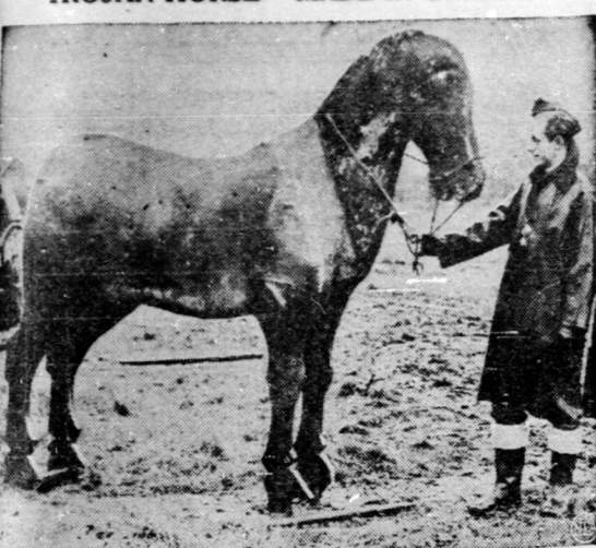
An Allied flyer examines a wooden horse, one of a number of dummy farm animals which Germans scattered over an airfield in Holland to deceive Allied bombers. Our airmen weren't fooled for long.