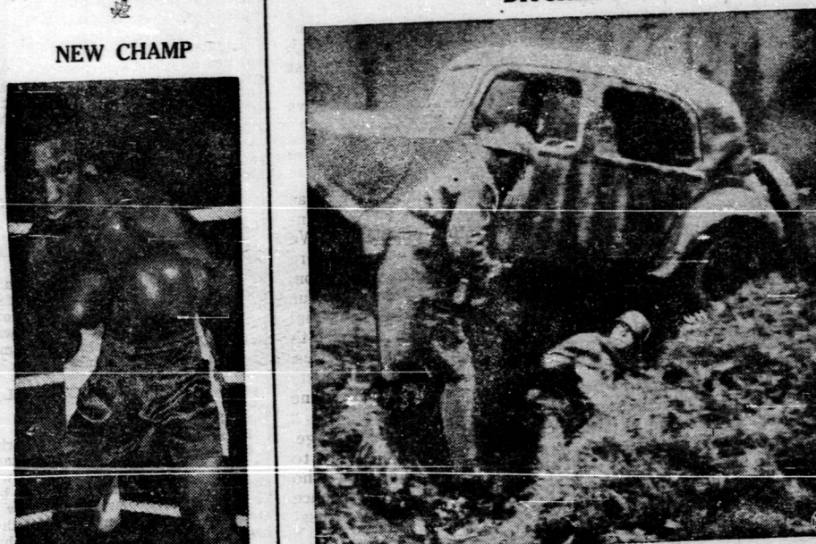
French infantryman has this Nazi where he wants him—in a ditch near Belfort, France. In bullet-riddled car are bodies of three others whose flight ended in sudden death.