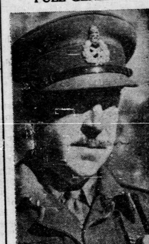
This is a new picture of General H. D. G. Crerar, C.B., D.S.O., General Officer Commanding-in-Chief, First Canadian Army, who has been promoted to that rank from Lieut.-General.