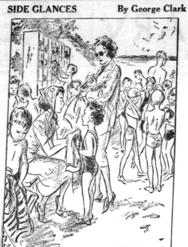
"Just look! And I told that camp counselor not to let you get a single freckle on your nose this summer!"