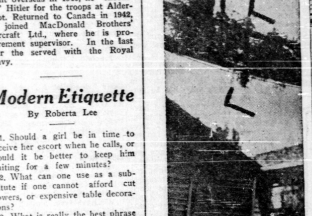
One of the first things citizens of European towns liberated by Allied forces do is to let the world know what they think of their erstwhile Nazi and Fascist masters. Typical reactions are shown above. At left, a Frenchman smashes a swastika erected by Nazis over a triumphal arch. At right, a Roman policeman risks his neck to tear down the black flag of Fascism from a public building.