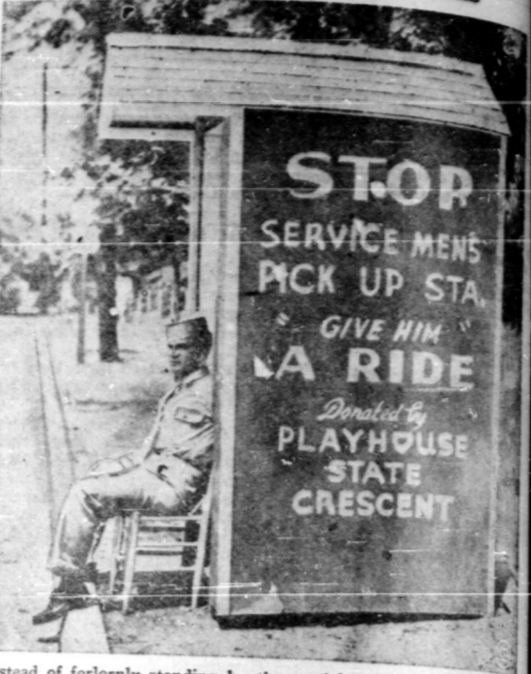
Instead of forlornly standing by the roadside, waving his thumbs, a soldier sits comfortably in front of one of the stations erected at Statesville, N. C. for use of hitch-hiking G. I.'s. He'll not have long to wait for Tarheel motorists who have learned to keep eyes peeled for these stations.