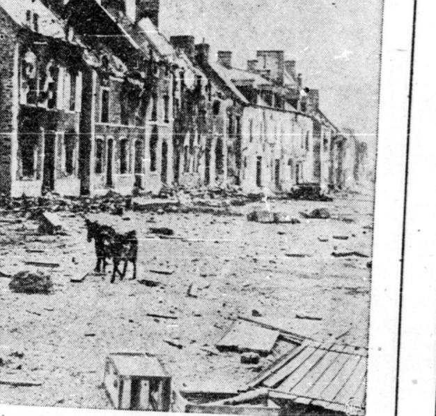
Only signs of life in above photo of deserted Montebourg, bitterly contested French town finally won by Allies, are two goats who wander through the littered streets after Allied shelling and German demolition squads reduced town to skeleton buildings and charred rubble.

GOOD—OR ELSE You Will Enjoy Staying At The ST. REGIS HOTEL TORONTO Every Room with Bath, Shower and Telephone. Mineral, $2.50 up. Double, $3.50 up. Good Food, Billiards and Dancing Nights. Shirbourne at Carlton Tel. RA. 4125