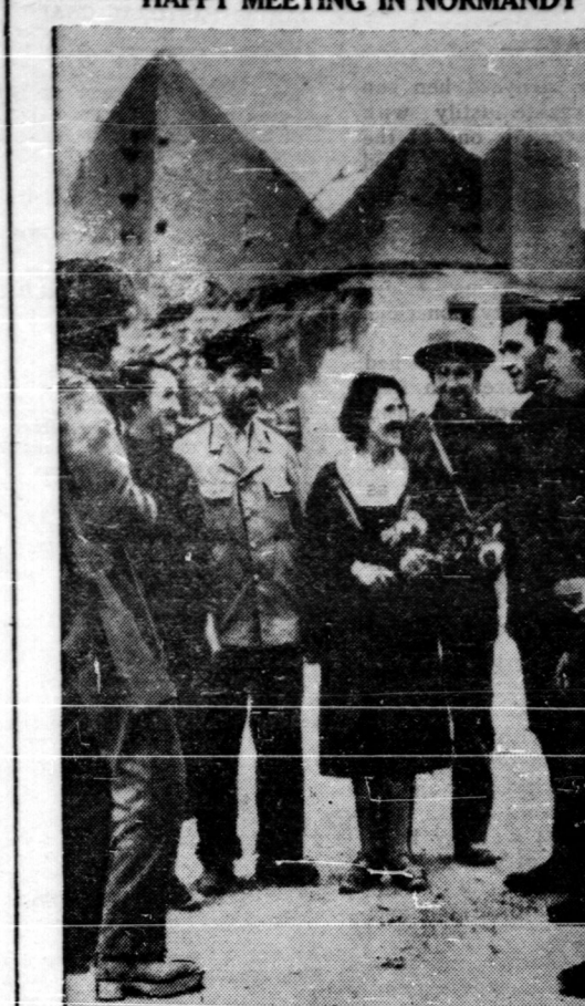
Canadian soldiers and airmen are seen here in happy conversation with two women and a grandchild of the liberated town of Caen.