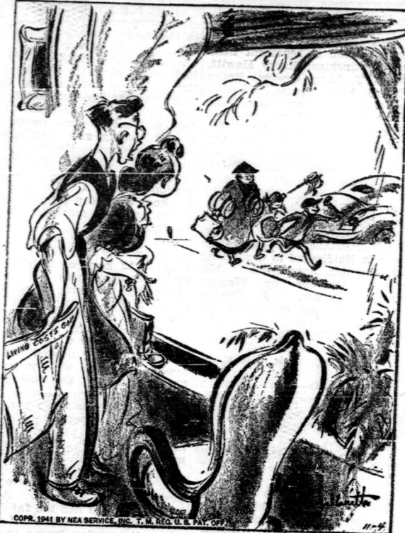
"Here come your Uncle Dan, Aunt Maude and the kids! They're pretty prompt about paying back that summer visit!"