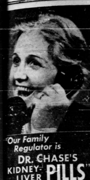
Our Family Regulator is DR. CHASE'S KIDNEY-LIVER PILLS