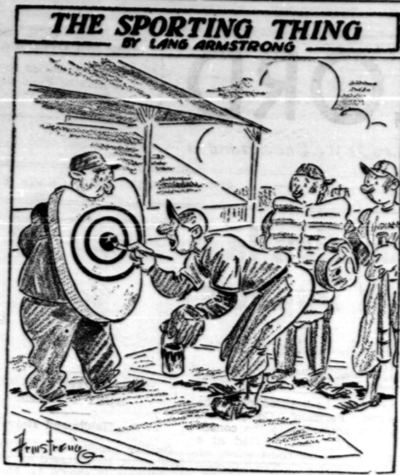
"Do you mind?"