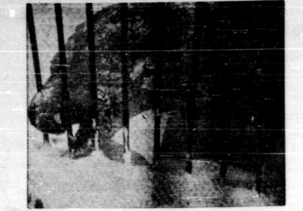
Mr. Polar Bear of the Bronx zoo, New York, is evidently anxious to have his quarters. It looks like a good romp in the snow on the other side, but bars make awfully tough eating.