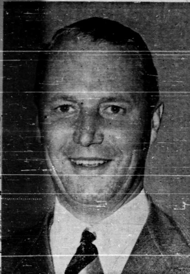
THE HON. GEORGE A. DREW Premier of Ontario