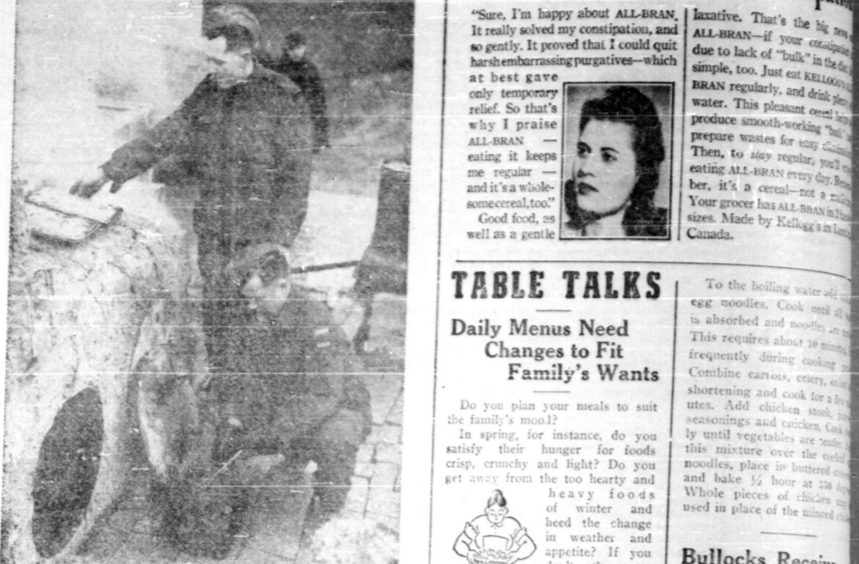
Delicious army meals come from these ovens made of scrap material. Canadian Army cooks are trained not only in cooking, but in how to build and maintain kitchen equipment.

of them too good—in a small cafe reeking of fried potatoes, the only idea that occurred to Christine was that she was practically broke, and stranded alone in one of the most expensive, most heartless pleasure resorts in the country. As often happened when she was deeply absorbed, she reached for a pencil—found one a waitress had left on the table, and the only drawing surface at hand, the back of a menu card—and began to sketch. Christine compared her sketch with the original, and its insufferably self-satisfied looking proprietor of the cafe; she was frowning over the finishing touches when a voice said, "Excuse me, but that's really excellent." Startled, Christine turned. A plump, neat little man—dressed except for a tuft of hair well back on his head, in a dark suit, with a clerical air—was looking at her sketch through his spectacles. "He might have been any small-town business man, or a teacher, or a clergyman on vacation... Christine decided against the clergyman. After all, this was Surf City. When Christine looked up, he gave a funny duck of a bow and he looked so like he was afraid of offending her, and because Christine was a friendly young woman, she gave him her best smile and said, "Thank you." "I suppose," he asked, "that you are employed somewhere as an artist?" "I wish I were," Christine replied from her seat.