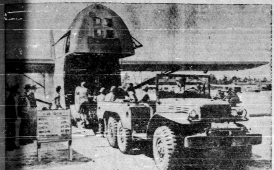
Here's the United States Army's new glider—biggest of its "whisper ship" fleet, recently displayed at Laurinburg-Maxton Air Base, N.C. The CG-13, which will carry 30 men and cargo, is pictured taking aboard a field gun and its six-wheeled motor unit. Empty, the craft weighs 7900 pounds, with maximum gross weight of 12,000 pounds, has a wing span of 85 feet, 8 inches and a top speed of 150 m.p.h.