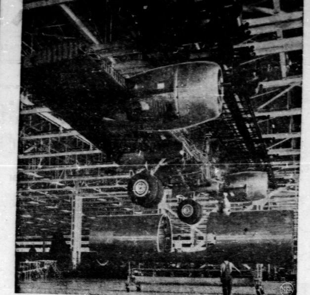
This will give you an idea of what goes on in the B-29 assembly plant at Wichita, Kan., where this 17-ton main center wing section...

We Can't Do Less Than They Now is the time to get your hands in order to buy Victory Bonds when sales start October 23.