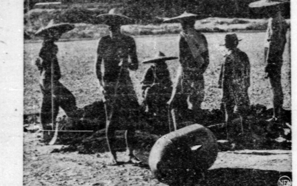
Photos and map above tell the story of the United Nations' defeat by Japs in China that is causing a crisis in Sino-U. S. relations. Under the relentless Jap drive to cut China in half, American air bases, most of them built by the blood and sweat of hundreds of thousands of Chinese men, women and children, have been abandoned and destroyed by the U. S. Air Forces.