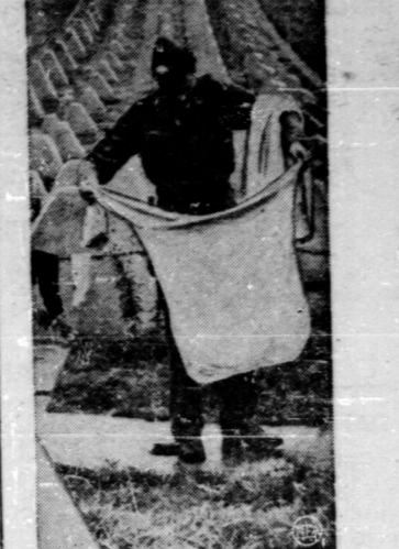
Making good the words of the dirty they sang in 1940, the British are now 'Hanging Out Their Wash on the Siegfried Line,' as demonstrated by this RAF man who stretches his shirt across the barbed wire barrier on the 'dragon's teeth' installations.

Now Ease COLD... SORE THROAT PAIN! Aspirin Relieve Pain Almost Instantly! Drop one Aspirin Tablet in a glass of water. See it start to dissolve almost instantly. Within two seconds it begins to disintegrate, and this same speed is duplicated over your stomach. Thus, you get relief almost at once!