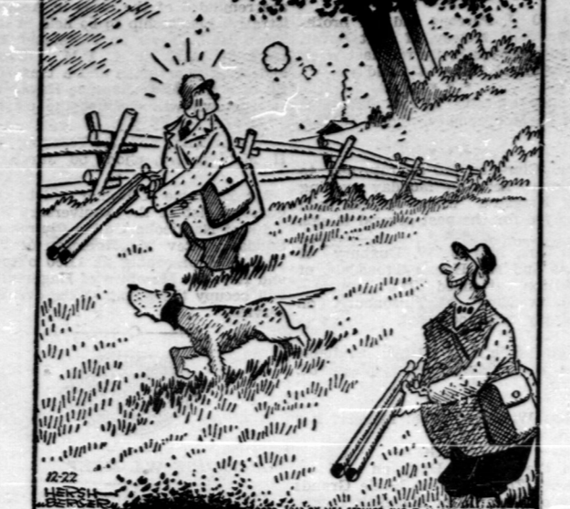
"He's a dyed-in-the-wool Southern pointer—he refuses to point north!"