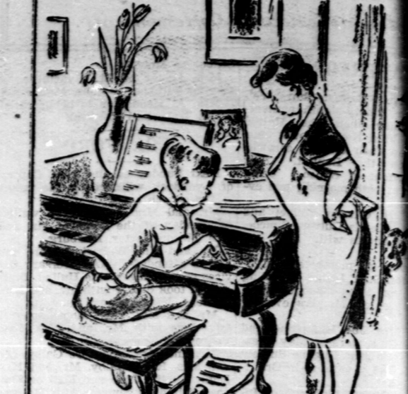
"It seems to me there's enough trouble in the world, Mot without making me keep up these old piano lessons."