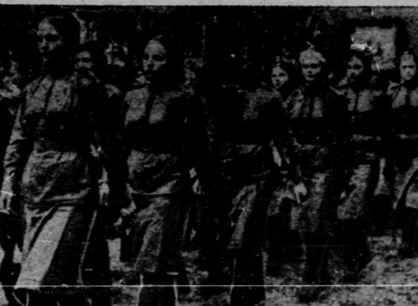
Training for war these women attached to the Russian Army's nurses, swing smartly back to barracks after morning mass at their revolutionary, Kosciuszko who fought the czar in the 18th century.