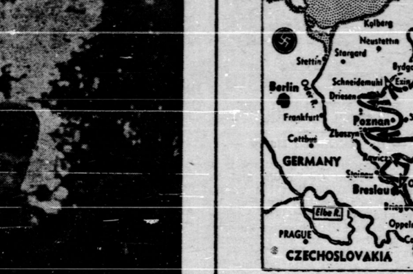
As Russian tank spearheads drove to Driesen, 91 miles from Berlin, the Red Army newspaper announced that they had "reached the last road" to victory. Meanwhile, the Soviets say all direct communications with Breslau have been cut off and the Germans report the Red Army has launched an all-out drive for Konigsberg.