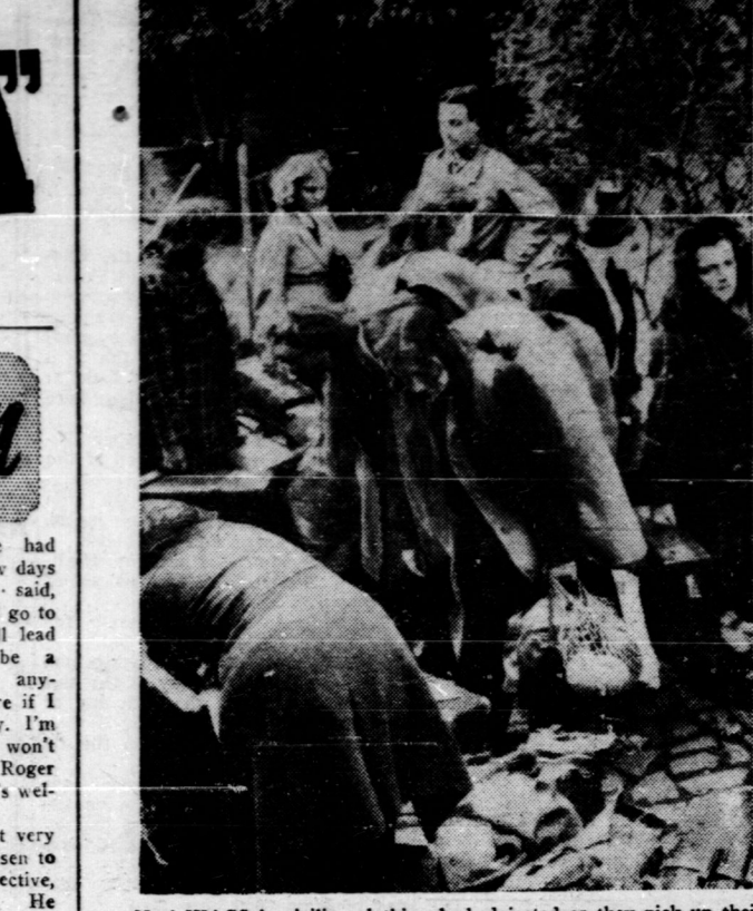
Nazi WACS in civilian clothing look dejected as they pick up their baggage in Germany. Husky women with tousled hair are en route to a prisoner of war enclosure after receiving word from headquarters that their country had surrendered unconditionally to Allies.