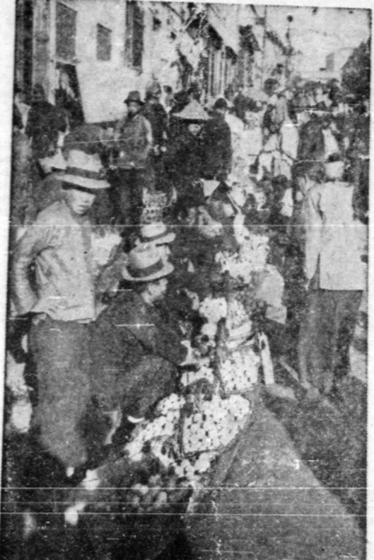
Eggs, which have been scarce in most war areas, come into their own in outdoor market of Tsingtao, a port of North China. The Chinese have been without the type of food for so long, it is considered a delicacy.

Act 15: 22-29 —Here we have the first mention of writing in the history of the Church. The letter contains (1) kindly greetings to Gentile brethren; (2) a strong repudiation of the Pharisaical Jews who had gone from Jerusalem to Antioch and interfered with Gentile liberties there; and the statement that a deputation who really represented the views of the Jerusalem Church are sent; (3) a full recognition of the authority of Barnabas and Paul by the apostles of the circumcision; (4) a declaration that circumcision is not necessary to salvation; and (5) prohibitions which enjoin abstinence from certain practices in which heathens indulged. These prohibitions were concessions demanded from the Gentile Christians for the purpose of preserving peace, unity, and fraternal intercourse between Jews and Gentiles, and also of protecting converts from the results of heathen associations and habits.