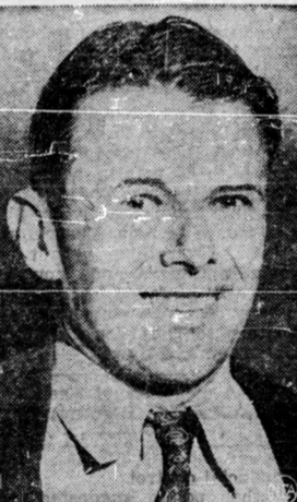
Douglas (Wrong Way) Corrigan, who electrified the world in July 1928, when he made a forbidden flight—"by mistake"—from New York to Dublin, Eire, in a dilapidated and obsolete plane, has filed his name for the U. S. Senate.