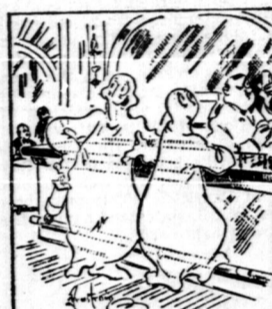
"This used to be one of my old haunts!"