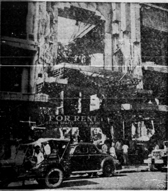
An enterprising property owner hopefully displays a "for rent" sign on what is left of a Manila store building, reduced by bombings to only a shell.