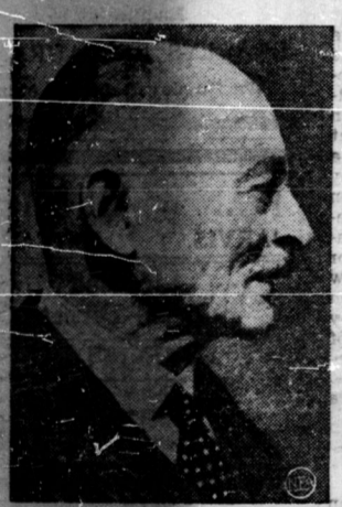
Gen. Maxime Weygand, above, 78-year-old former commander-in-chief of the French army, is on trial in Paris.