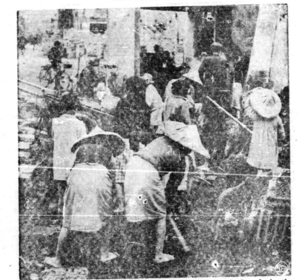
Children of Tainan, Formosa, labor with picks and shovels in the ruined city's streets, removing and salvaging wreckage.

Liberated after 51 years of Japanese rule, Formosans today are not sure whether bondage to the Jap was not preferable to the "freedom" of their last six months, under Chinese rule. Famine, widespread unemployment, black markets and economic robbery impose heavy burdens. These exclusive pictures, showing young children toiling to make their meager living, were taken by Harlow Church, NEA-Acme correspondent, first Occidental photographer to visit Formosa since 1926.