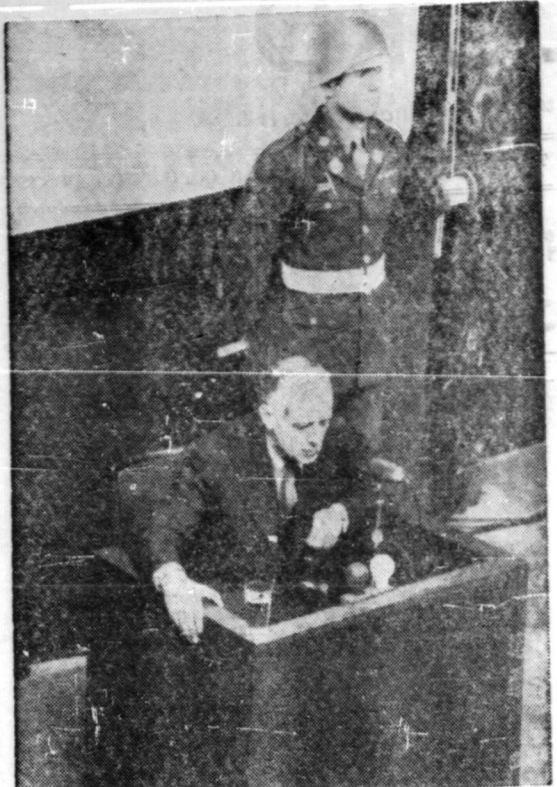
"Lied," admits Joachim von Ribbentrop, former German Foreign Minister, during cross examination at Nuremberg war criminal trials...