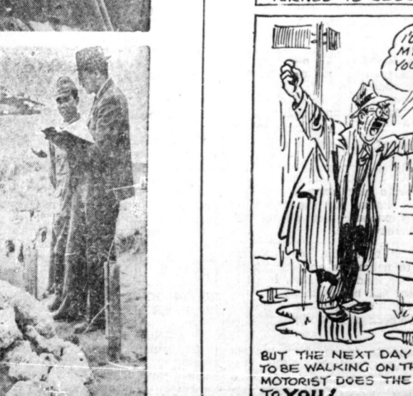
BUT THE NEXT DAY WHEN YOU HAPPEN TO BE WALKING ON THE STREET, THE MOTORIST DOES THE SAME THING TO YOU!