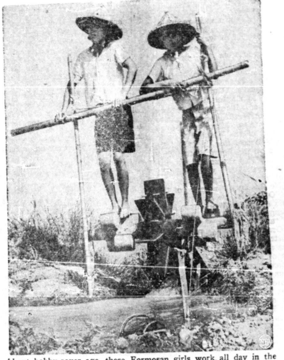
About hotly-oxer, these Formosan girls work all day in the hot sun, tread-milling on a primitive irrigation ditch.