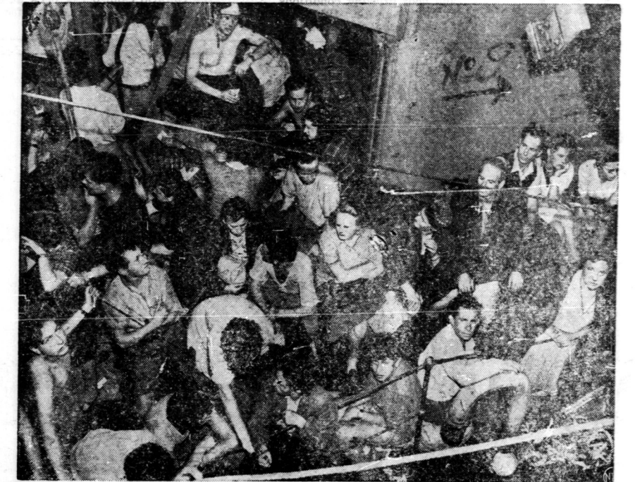
MONTY MUST HAVE KNOWN SOMETHING

In the dark of a mid-summer night recently, a former Canadian corvette, the Josiah Wedgwood, slipped from an unnamed European port and headed for Palestine. About the vessel, crammed into every inch of deck space, above, were 1300 Jewish refugees, seeking escape from authorities and refuge in Palestine. Their journey and their destination were illegal, but a makeshift banner, left proudly ported by their spirit and defied intervention. Seventy-three miles out at sea British warships spotted the outlaw craft, lay in wait until it entered territorial waters, then closed in. The corvette halted only after a British destroyer fired three shots in warning. The refugees, below, their flight a failure, quietly accepted detention. They were held at Athlit Clearance Camp at Haifa, Palestine, on an official charge of being a "menace to navigation."