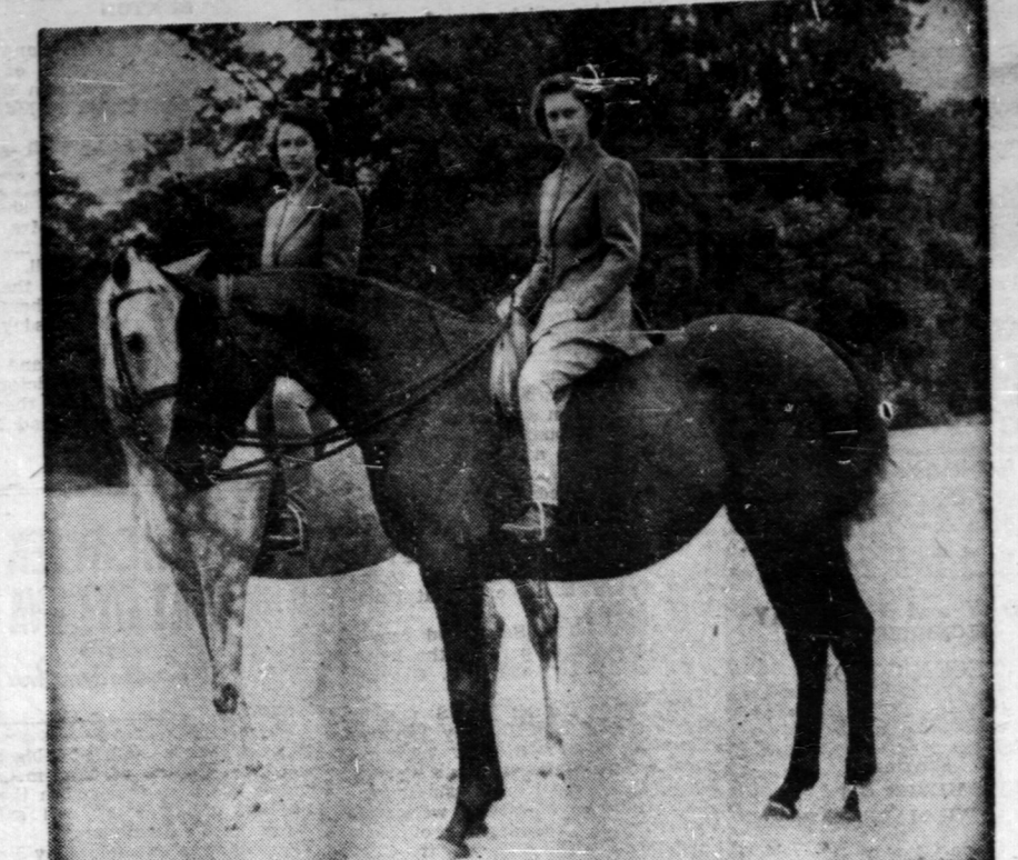
Her Royal Highness Princess Elizabeth, heir to the British Throne, with her sister, Princess Margaret Rose, are photographed in the grounds of the Royal Lodge at Windsor.