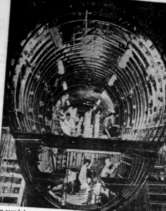
Its rounded upper and lower deck sections forming a gigantic figure 8 that dwarfs the workers, part of the body of the new Boeing Stratocruiser, peacetime version of the B-29, is shown nearing completion at Seattle, Wash. The huge double-decked luxury airliner will carry 80 passengers.