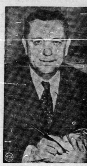
Oscar L. Chapman, Assistant Secretary of the Interior, will serve as acting Secretary following the resignation of Harold L. Ickes. He is shown at his desk in Washington. No permanent successor has been named by President Truman.