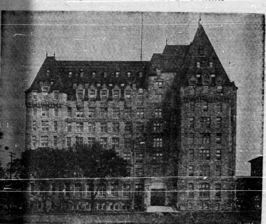
Dominion headquarters of the Royal Canadian Mounted Police, the Justice Building in Ottawa, will be the focal point of Federal investigations into treason charges involving Dominion Government employees.