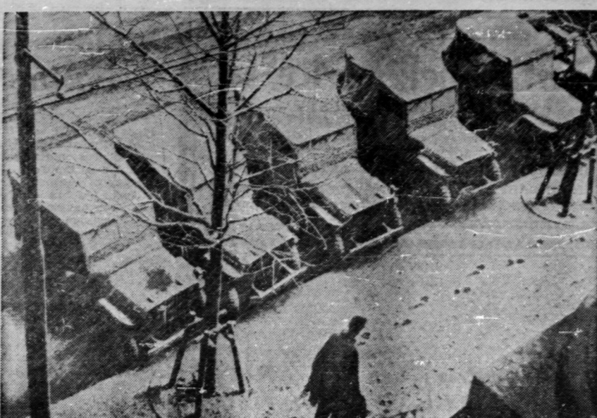
Lined up at Fifth Air Force Headquarters in Tokyo, these jeeps are quickly covered with a blanket of wet snow as the heaviest fall in more than 20 years blanketed the city. GI in foreground leans forward against wind.