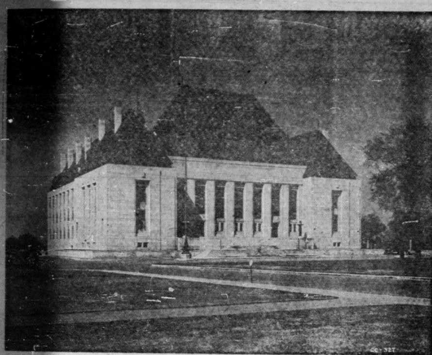
The new Supreme Court Building in Ottawa, which houses the offices of the Government-appointed Royal Commissioners.